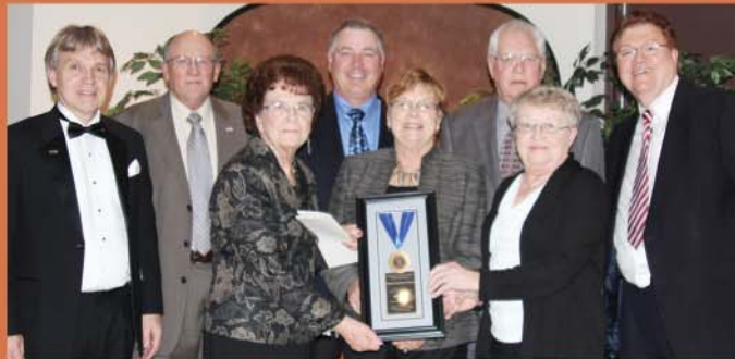
Members of the former Blanchard Lutheran Church were recognized.