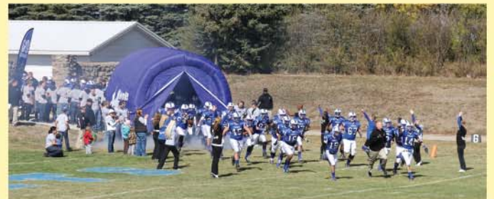
The Comets made a grand entrance at the football game.