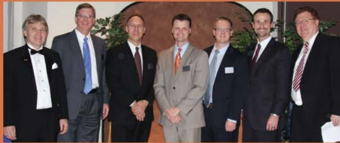
Bell State Bank & Trust sponsored the event.