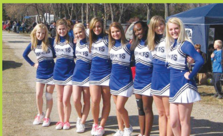
The newly formed Comets cheer team joined in the fun at tailgating festivities that took place northwest of Jerome Berg Field.