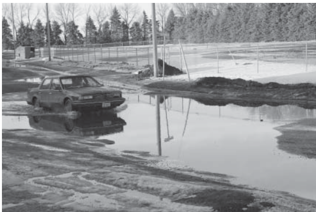
Drainage issues create serious problems for vehicular and pedestrian traffic east of the Lewy Lee Fieldhouse each spring.

As of April 8, 2013, both projects had passed Senate consideration and were under consideration by the House of Representatives.