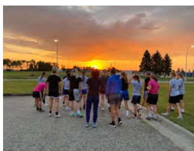
"AM" TABATA WORKOUT