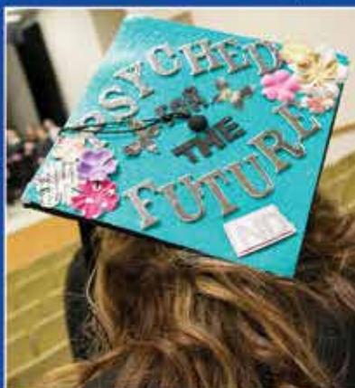
The mortarboard says it all.