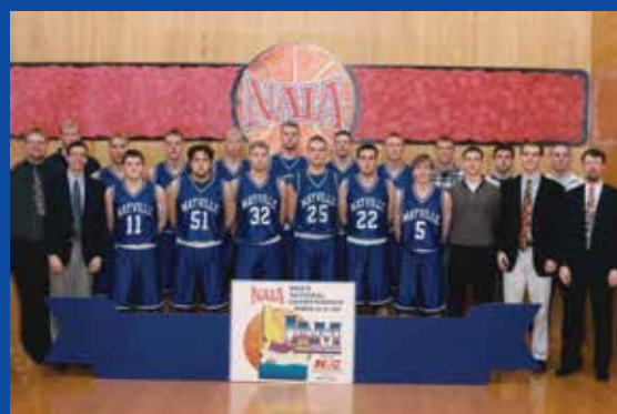
1996-97 Men's Basketball Team