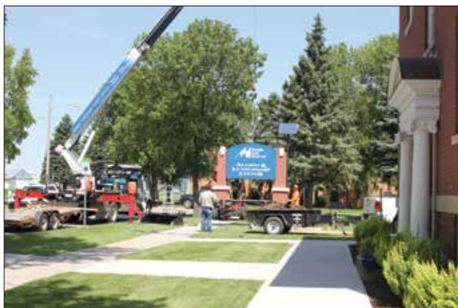
A beautiful new lighted sign was installed at the Edson and Margaret Larson Alumni and Leadership Center as the Alumni Day festivities began. Funding for the sign was provided by the Edson and Margaret Larson Foundation.