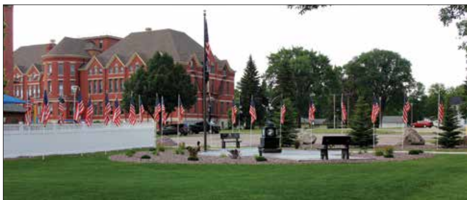
Landscaping of the Military Honor Garden was completed just in time for the 2016 Alumni Day festivities.