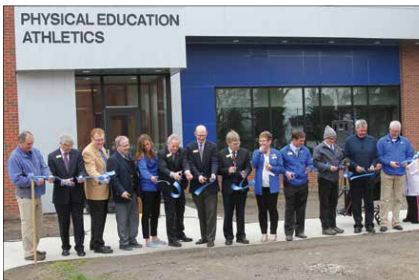
Members of the building committee were among the folks to cut the ceremonial ribbon, marking the official grand opening of the new and improved HPER facility at Mayville State.

The state-funded HPER project, which began in April of 2015, reached substantial completion on March 1, 2016. It involved replacement of the 1929 Old Gymnasium and expansion of classroom and lab/practice space for Sports Management, Fitness and Wellness, Health Education, and Physical Education majors. Additions were constructed on the east side of the existing Lewy Lee Fieldhouse, and the bulk of the renovation included constructing new classrooms and an athletic training area on the west