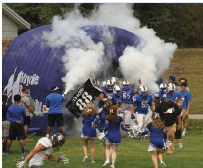
The Comets football team makes a grand entrance at their home opener in 2015.

The Comets began their season at home against Buena Vista University on Sept. 3. Following their opening game, they headed to Quincy, Ill. to take on NCAA Division II opponent Quincy University. Farmers Bowl weekend will be headlined by the Comets football team hosting the University of Wisconsin-Stout on Sept. 17. After a bye-week, the Comets will host rival Valley City State in the homecoming game on Oct. 8 at 2 p.m. Last year, the Comets spoiled the Vikings' homecoming celebration as they marched into Valley City and beat them on their home turf by a score of 14-13.