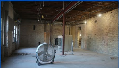
This space was most recently occupied by the business office.

This doorway was revealed when walls on the east side of the stairway leading to the lowest level from the south entrance of the building were removed. It is likely that this was a main entrance to the building when only the original east half of the building was in existence. Inside the door, remnants of a staircase can be seen.