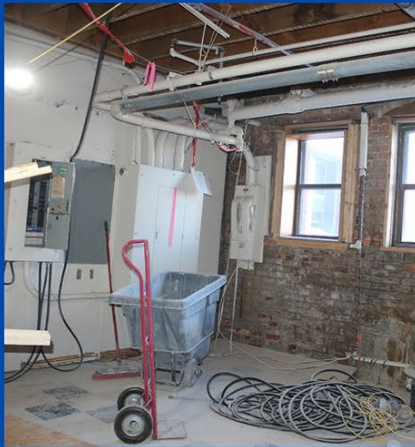
Lower level inside the north entrance.