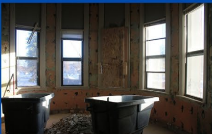
This space was most recently the president's office.