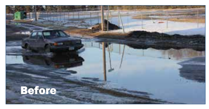
Prior to completion of the drainage project, Stan Dakken Drive flooded each spring.

The re-opening of the road marked the completion of a $2.2 million project, which has provided a great improvement to Stan Dakken Drive and the adjacent parking on the east side of campus. Storm water from the campus buildings and sidewalks now drains to a lift station south of Jerome Berg Field. The water eventually flows into the city drainage ditch on the east end of town.