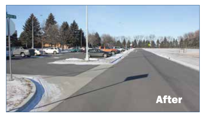
Parking is now located west of Stan Dakken Drive, rather than east of the road.