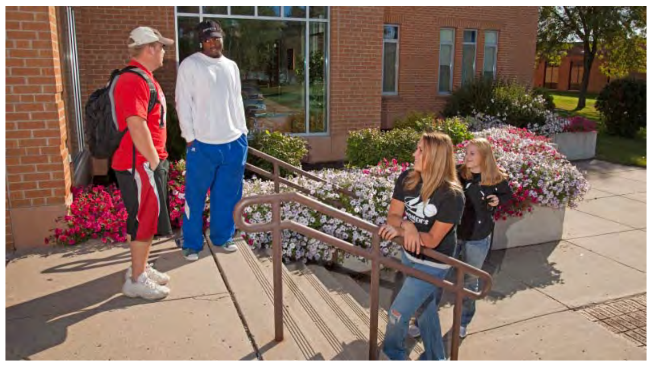
Mayville State University - 3

The campus covers 55 acres with the majority of academic buildings joined by connecting corridors to make traveling between classes a pleasure in cold weather. Adjoining the campus is a large recreational area. A football stadium, practice fields, tennis courts, swimming pool, handball/racquetball courts, and one of North Dakota's finest outdoor baseball diamonds complete the comprehensive recreational facilities. In 2004, a Wellness Center was added to the recreational complex for use by MSU students as well as community members.