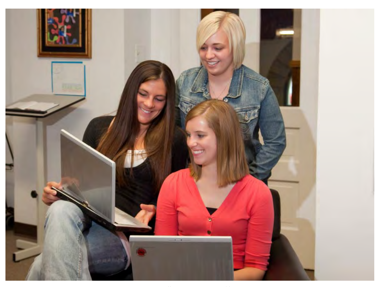
Mayville State University - 32

Appointments for counseling may be made by contacting Counseling Services, located in CB 115.