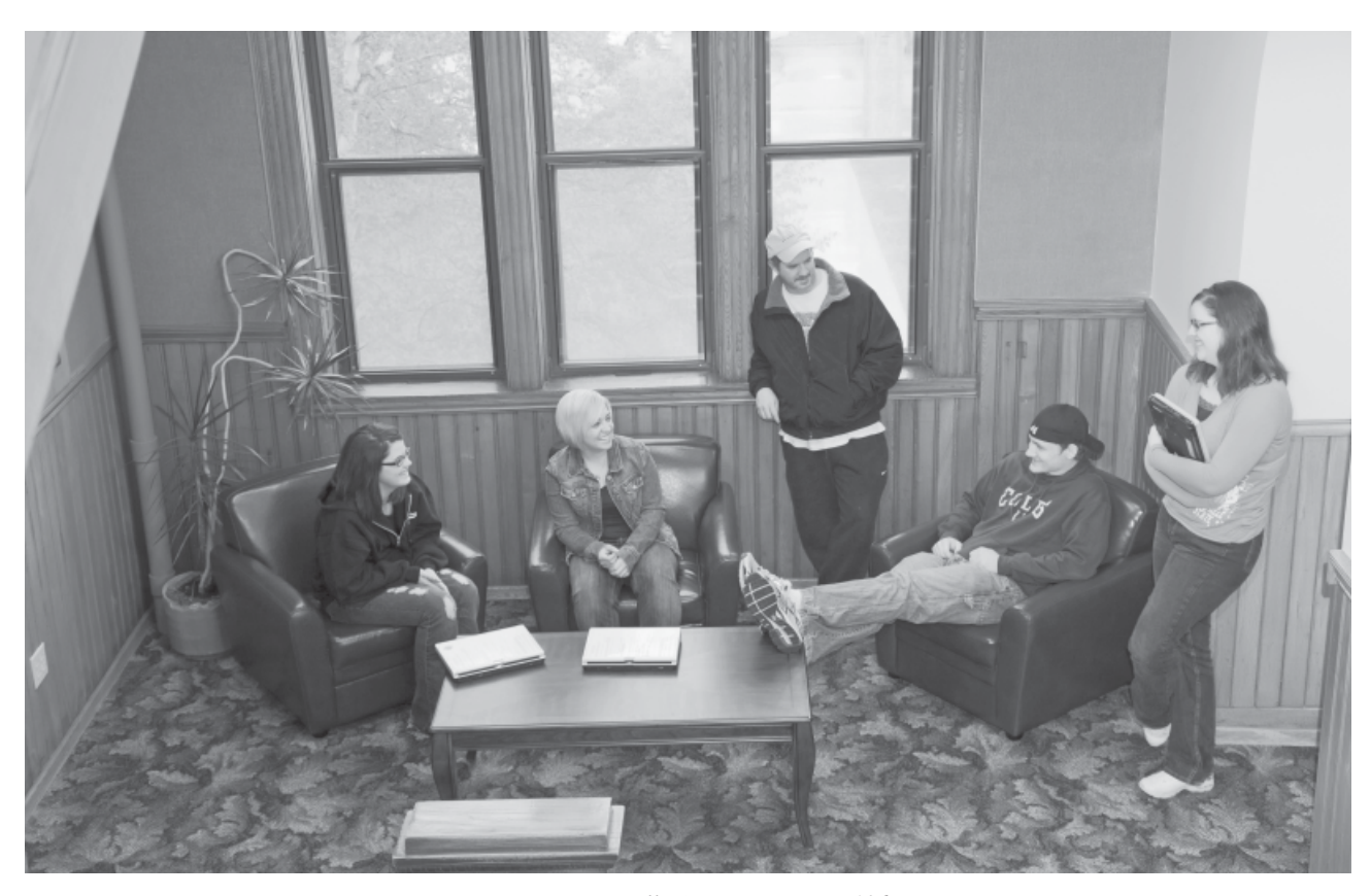
Mayville State University - 106