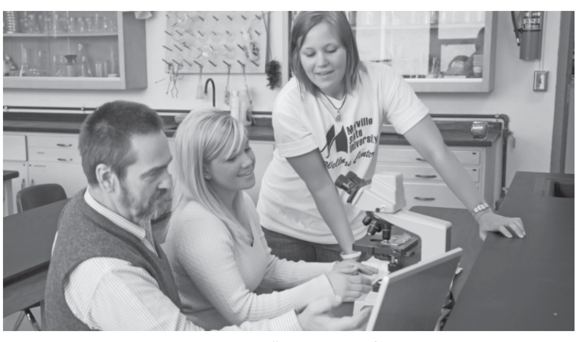
Mayville State University - 64

General Science Physical Science/Physical Education Science for the Elementary Teacher