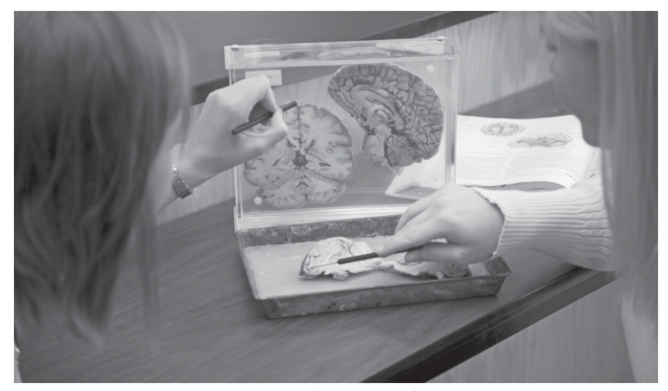
Mayville State University - 63

The goals of the Mathematics program are to foster the ability to think critically, to think mathematically in terms of precise and quantitative relationships which reveal the logical structure within a system, and to aid the student in developing an awareness of the vital connections and relationships between mathematical topics and their applications in the real world. Courses in this program prepare students to develop a conceptual understanding of mathematics, to reason and communicate through mathematics, to develop a proficiency in problem-solving using a variety of tools and strategies, and to use appropriate technology to enhance their understanding of mathematics.