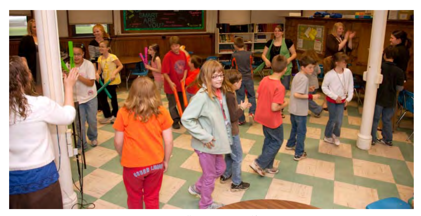
Mayville State University - 46