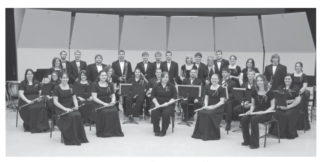
Mayville State University - 104

Learning a foreign language is a personally enriching experience. The study of another culture leads to new insights and perspectives on one's own history, society and values, while increasing an understanding of other people. Spanish 101 and 102 are designed to introduce students to linguistic and cultural structures necessary for basic communication in Spanish. The emphasis is on developing proficiency in the four communication skills of listening, speaking, reading, and writing.