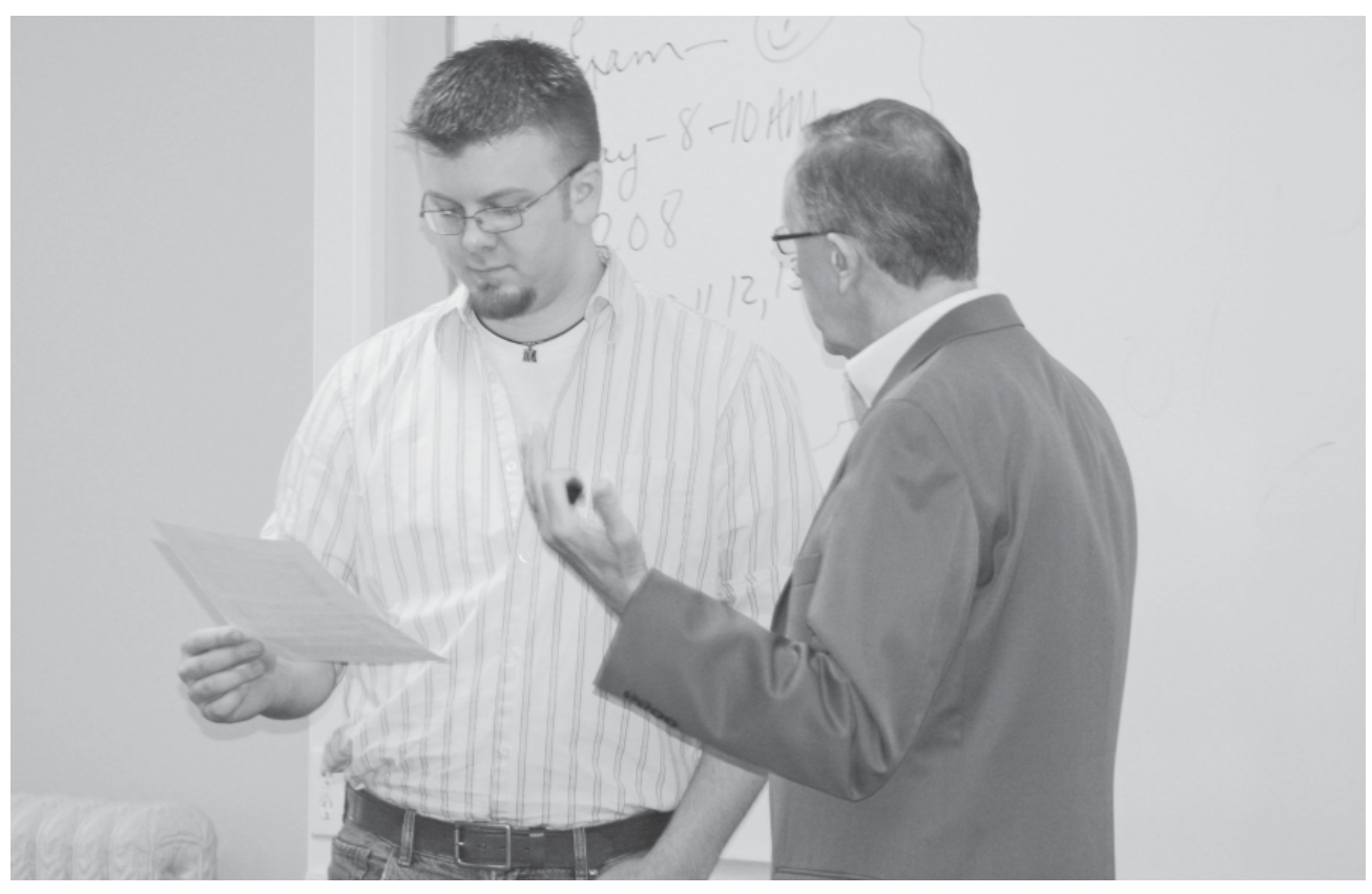
Mayville State University - 77