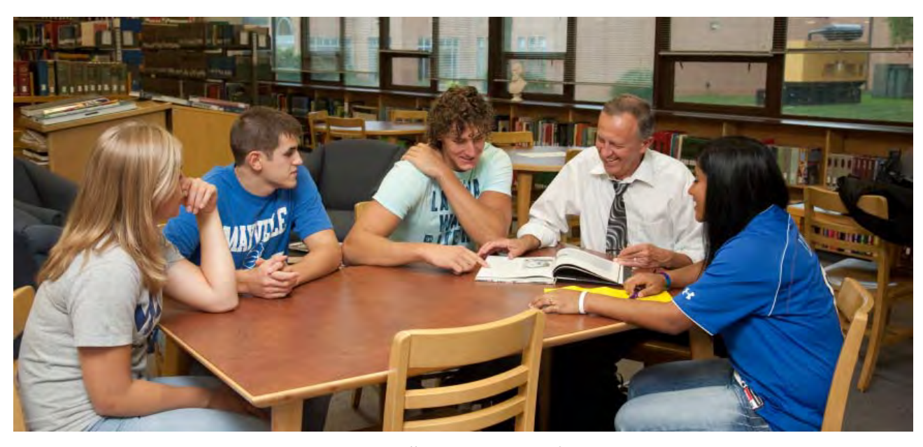
Mayville State University - 52

If a student receives an "F" (failure) in a course, he/she should repeat it as soon as possible if it is required for graduation. When a course is repeated to improve grade point average, only the last earned grade is counted in the grade point average. Each course registration and its earned grade, however, continue to appear on the transcript. Course repeats are not allowed on a on-to-one basis such as independent study or on an arranged basis. This policy may be appealed through a sub-waiver form when there are extenuating circumstances and would require approval.