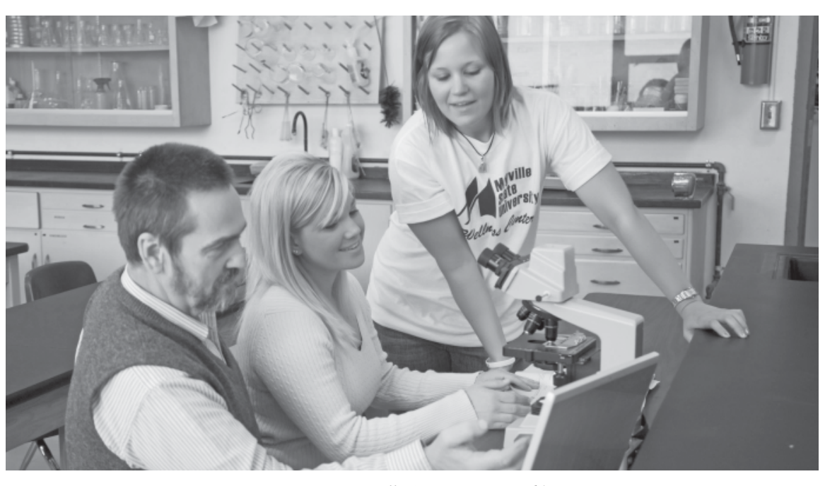
Mayville State University - 64

General Science Physical Science/Physical Education Science for the Elementary Teacher