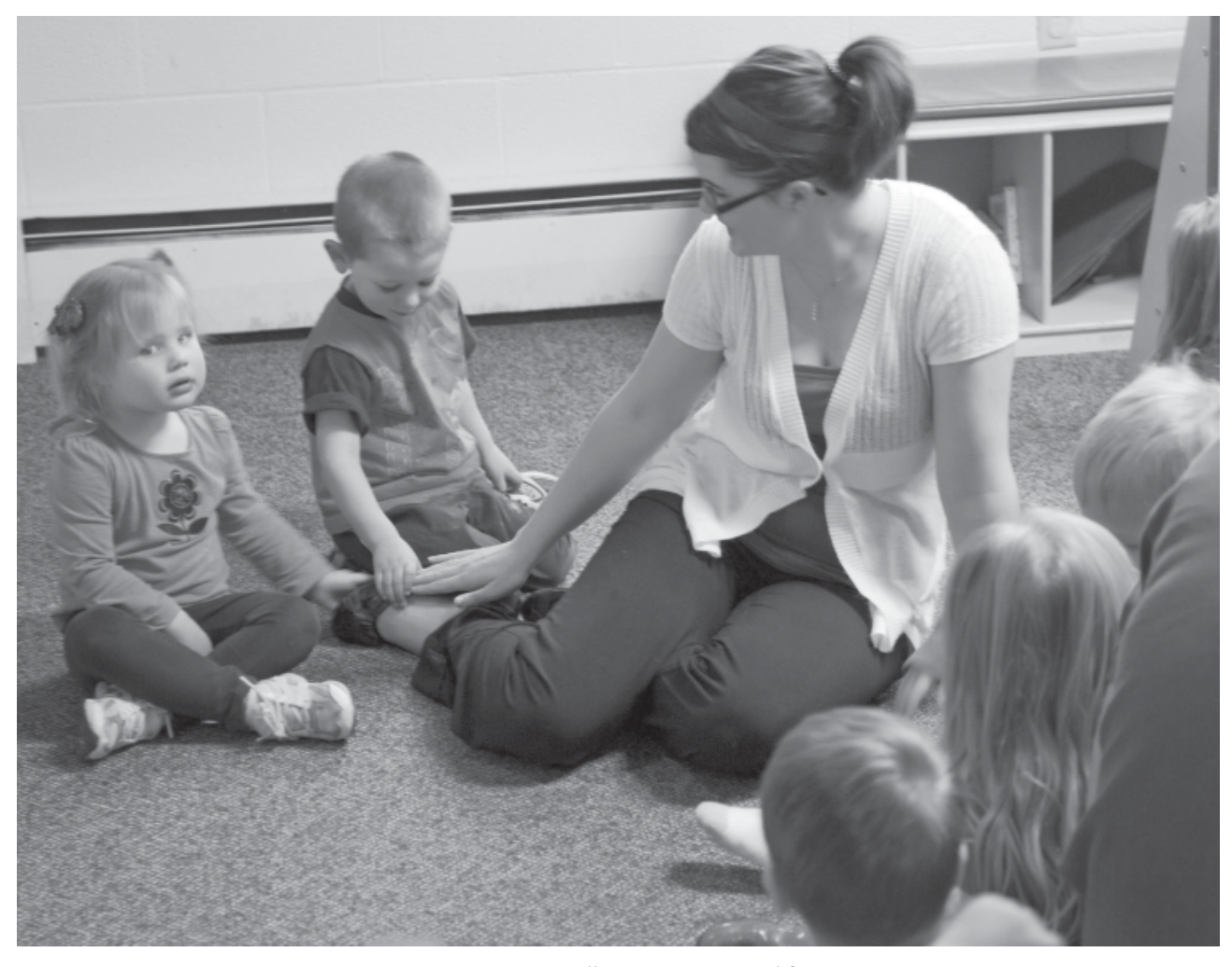
Mayville State University - 86