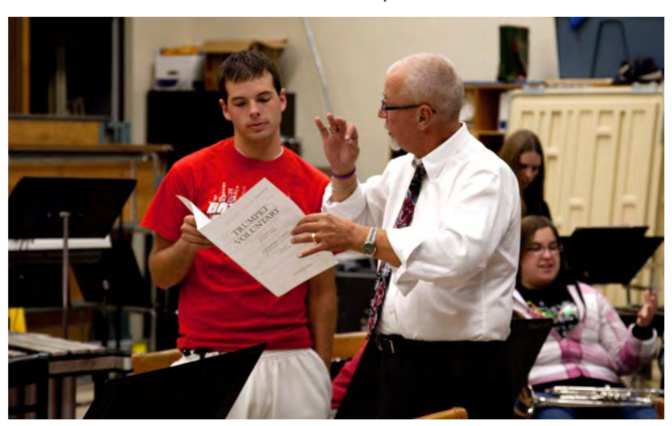
Mayville State University - 45

All students will complete common courses at the freshman and sophomore levels. Students will meet additional competencies by taking discipline-specific courses in their junior and senior years. A final assessment will take place in the senior capstone course or comprehensive exam.