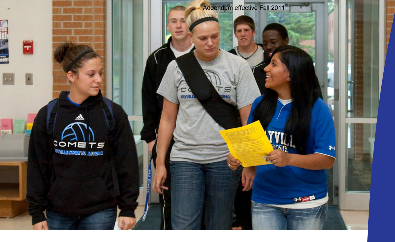
A Little More Like Home