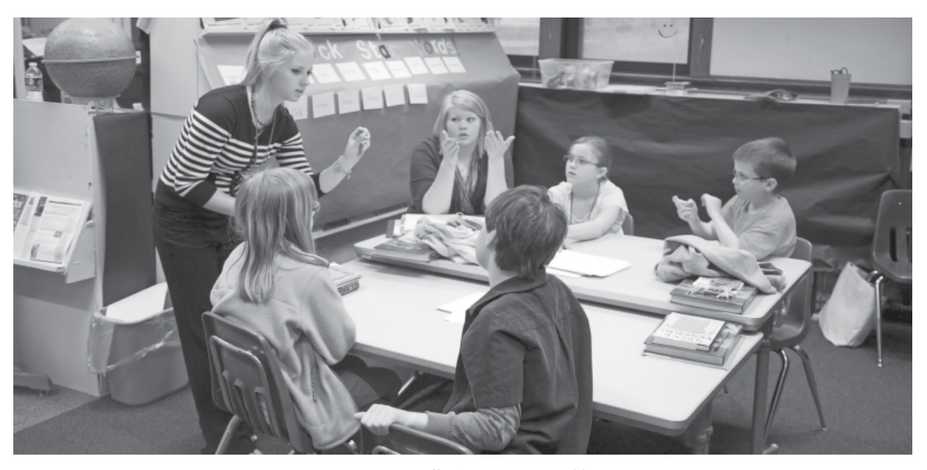
Mayville State University - 93

It is the student's responsibility to apply for the credential. Applications should be submitted simultaneously with the teacher certification application. The application for the reading credential can be downloaded at: <a href="https://www.dpi.state.nd.us">www.dpi.state.nd.us</a>.