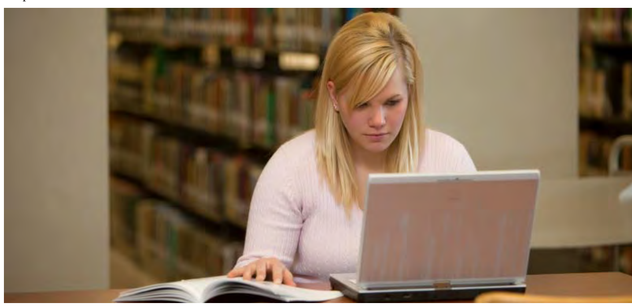
Mayville State University - 39

All MSU classes use a LMS (Learning Management System) to enhance student learning. The LMS includes tools for syllabi, course handouts, announcements, group and private discussions, test administration, Internet links, and delivery of course content. The typical classroom course uses one or more of the tools, while totally online classes use most of the available tools. MSU's current LMS is 'Moodle.'