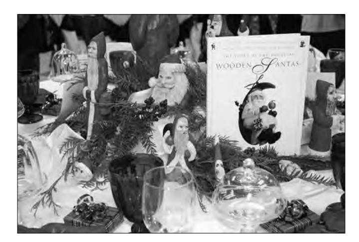
Lee Vinje's carved wood Santas were the decor for this table at 'Tables du Jour' 2012.